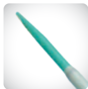
Radiopaque band available