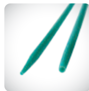
.018" dilator vs .038" dilator

GALT's Micro-Access ELITE HV™ Hemostasis Valve Introducer Kits provide the high quality expected for use during Cardiac Cath Lab and interventional procedures. They are specially designed to provide consistent performance every time.