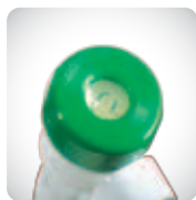
Hemostasis valve available