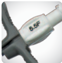
Tearaway introducer available in half-sizes