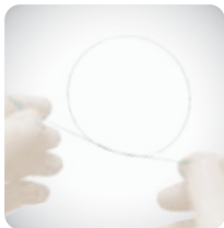
Kink-resistant core-wire design