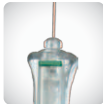
Includes safety needle