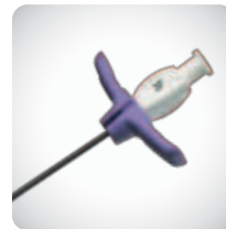
Introducer Sets available

GALT's Micro-Access/MST Introducer Kits and Sets were precisely designed for smaller access sites. Featuring 5cm, 7cm, and 10cm lengths with the option of half-sized configurations. Each introducer features a smooth transition, easy and secure locking system, unique wing design, and funnel-shaped lead-in.