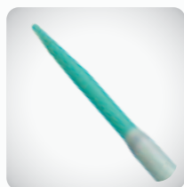
Radiopaque band available