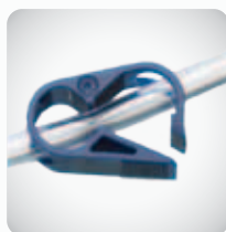
Color-coded clamps for easy identification

GALT's ReDial™ Hemostasis Valve Introducer provides reliable vascular access in a 4cm configuration. Access is gained with the less invasive taper configuration, while allowing for high flow and facilitating de clot procedures. Each sheath is individually packaged.